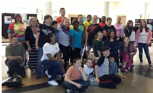
Congratulations Club 212 Students & Instructors!