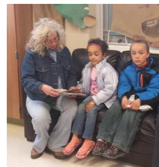
Family time for Reading at Reading Cove

Applications for Discovery Cove 2014/2015 are available online at www.afterschooldiscovery.com .