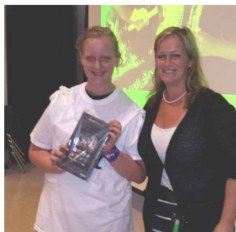
Club 212 Winner of the Kindle Fire