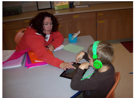
Students at Kinder Cove receive literacy instruction using I-pad technology.