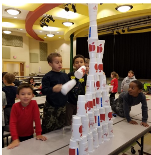
Cup Stacking Strategies

Starry Nights over AACCS Wade Campus! Earlier this year Discovery Cove students partnered with parents and community members in painting a paneled mural in the style of Van Gogh. Our combined art has become a large, single display hanging in the Michigan Primary main hall. Make sure to stop in this spring to look at everyone's work.