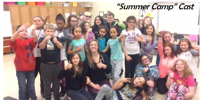
"Summer Camp" Cast

The students have already experienced the nerve wracking audition process and realized the importance of working as a team throughout each practice. Smiles are abundant each week despite the hard work they are putting in. Rehearsing their lines and developing their characters reinforces reading fluency and memorization skills. Other benefits to theater would include building confidence, the ability to collaborate with others and artistic expression...not to mention a creative outlet that reduces stress. AND, IT'S FUN!!