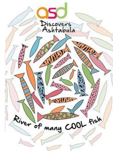
Theme for our Summer of Discovery 2014.