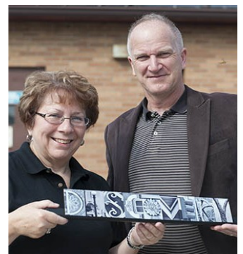
Check out the article "Sustainable Discovery" at www.ashtabulawave.org

We hate to think what our community would be like had there never been an ASD, let alone what could happen if ASD isn't sustained into the future. I believe that ASD is a program that is not only needed, but should be replicated on a national basis. But not everyone is able to sustain the program for as long as ASD has.