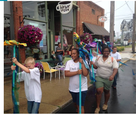
Students parading during the TABS festival.